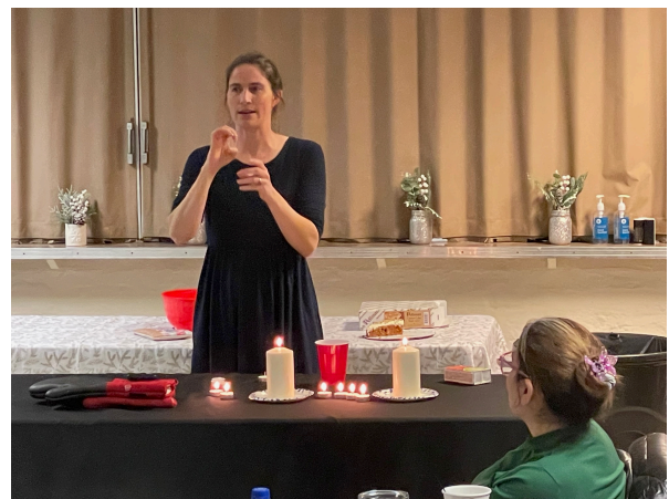
(Colleen teaching at the Ladies night)